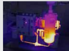
75 % blending